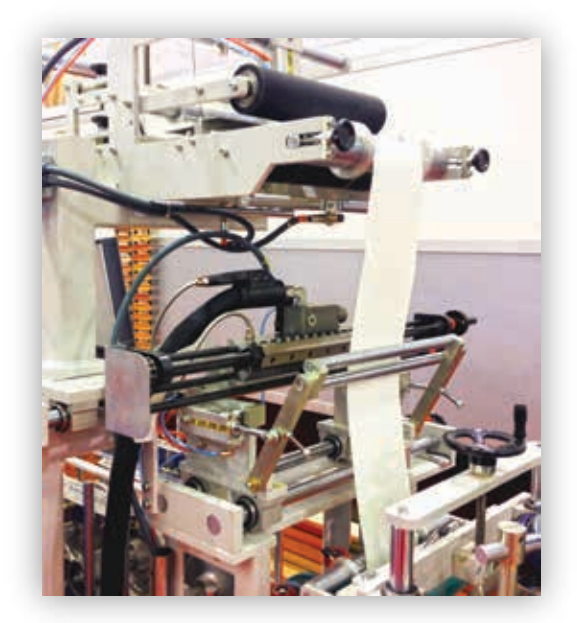
Approach Band System kicks-out when the machine stops, preventing burns and damage to the substrate.